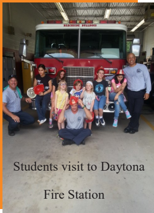
Students visit to Daytona Fire Station

The Center for the Visually Impaired STEPS Program creates opportunities for students in Brevard, Flagler, Putnam and Volusia Counties to broaden their knowledge of the world, develop an understanding of their role within their community and increase self-esteem.